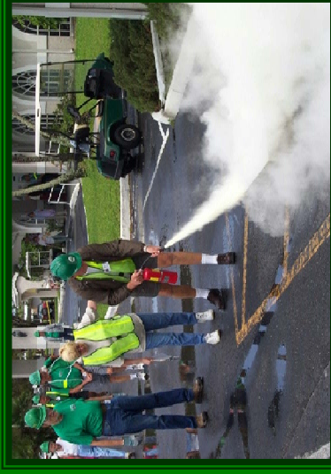
CERT Members During CERT Basic Training

Whether it's just learning...or volunteering – CERT is for everyone.